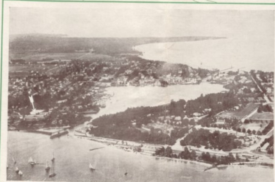
Airplane View of Charlevoix; Lake Michigan in the distance, Pine Lake in the foreground and Round Lake joining the two. Arrow points to Belvedere.

The Belvedere has boat houses available for guests and also boats for rent.