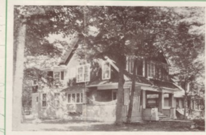
Belvedere Golf Club House