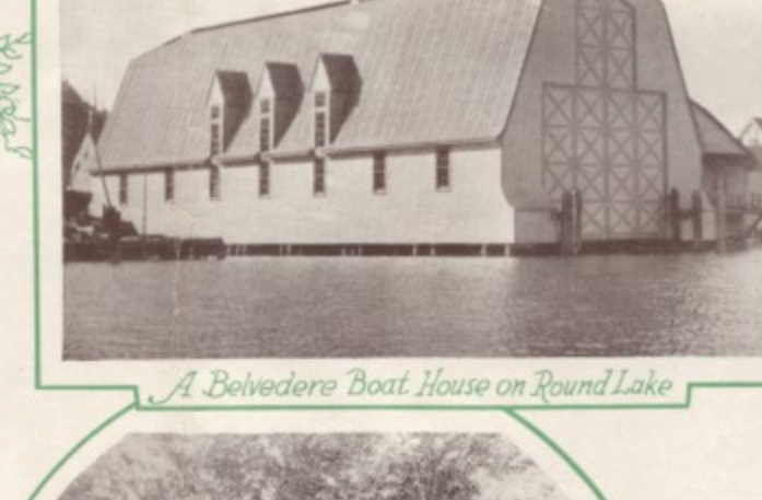
A Belvedere Boat House on Round Lake