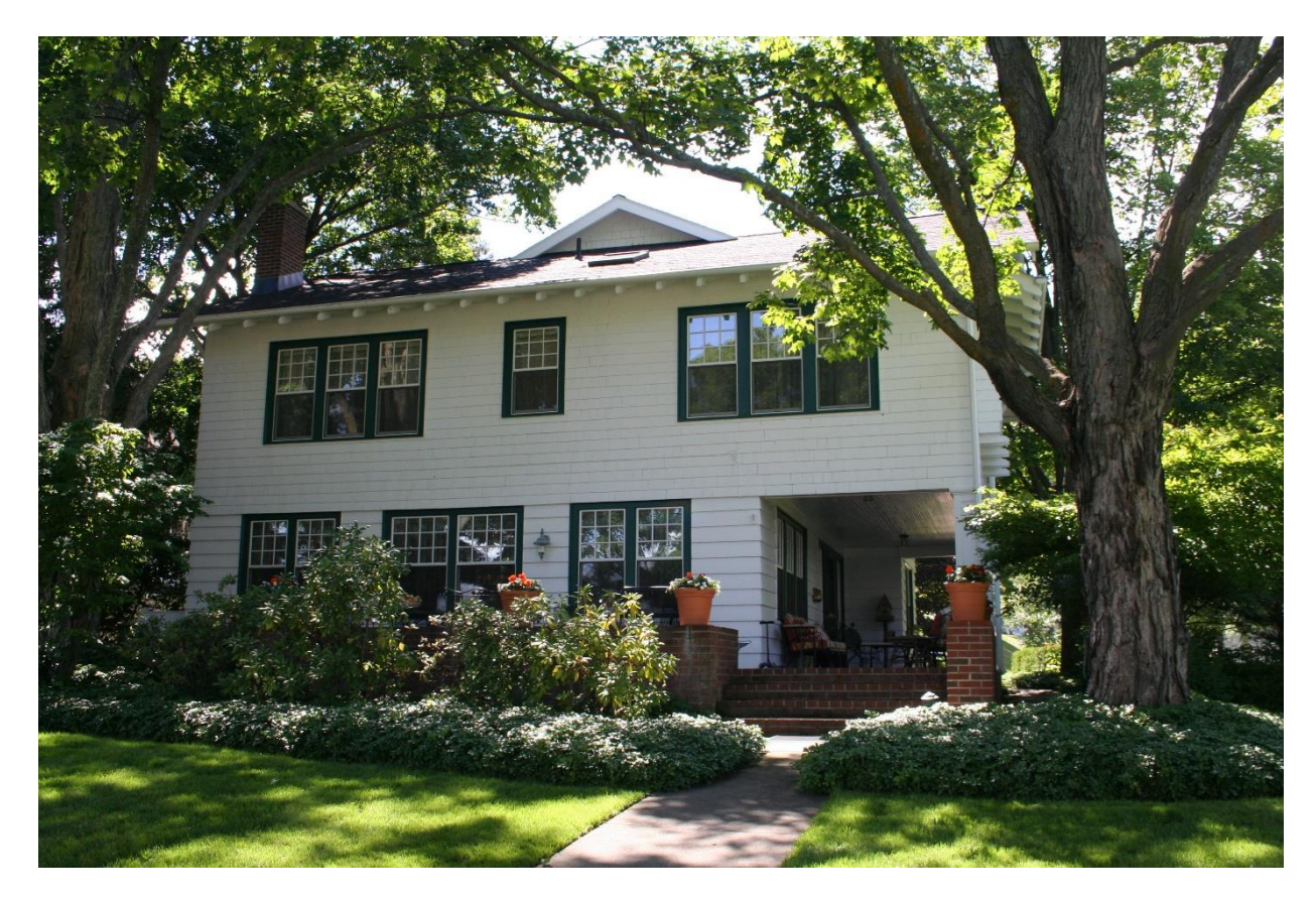
2019 - East