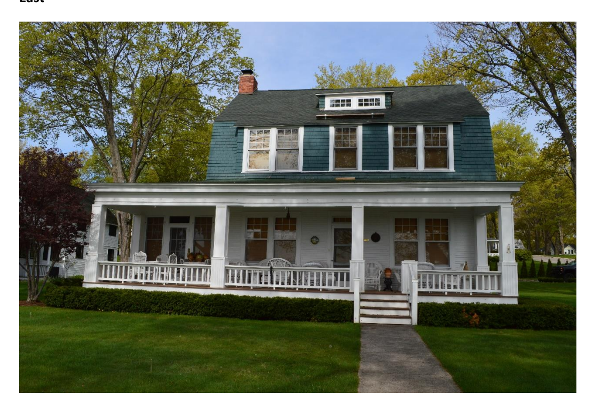
North and west