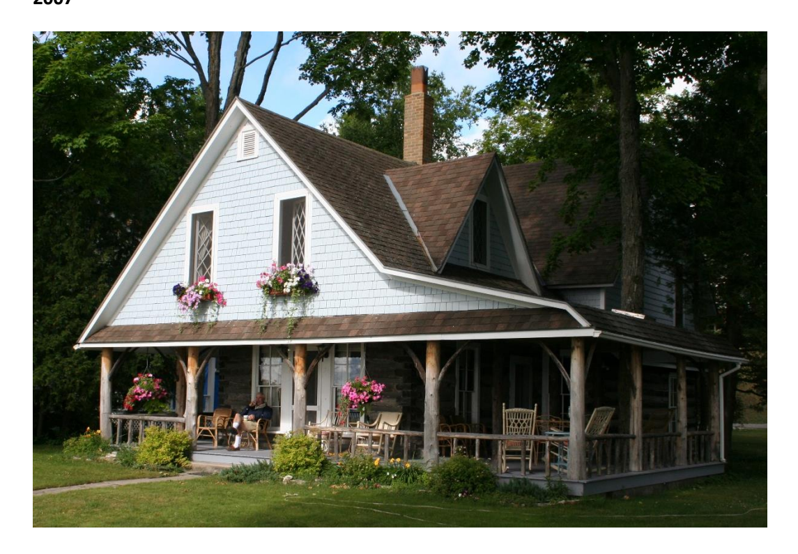
2019 - East and north