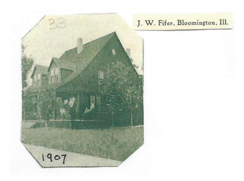
2019 - East and south