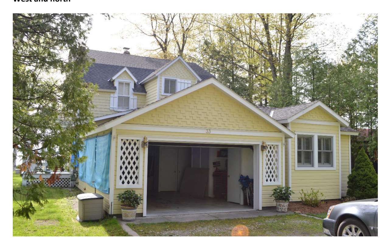
West and south