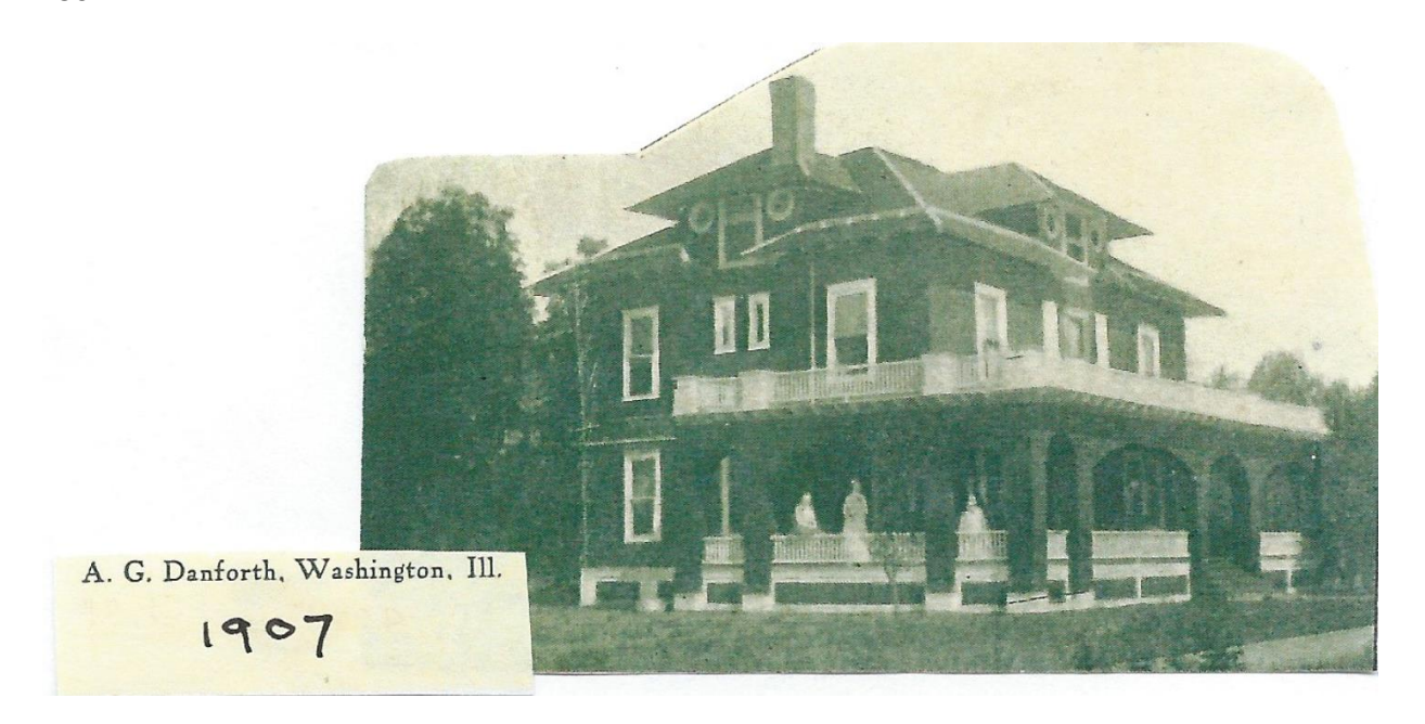
2019 – East