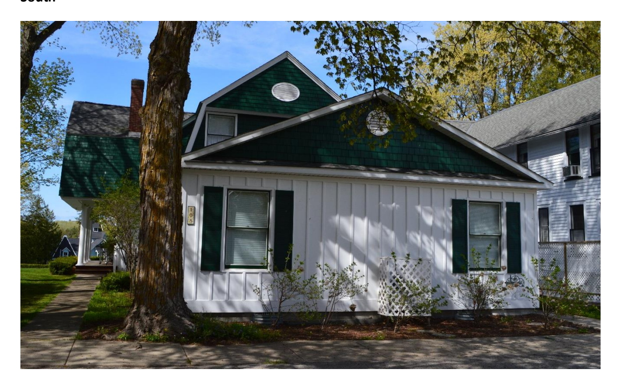
South and east