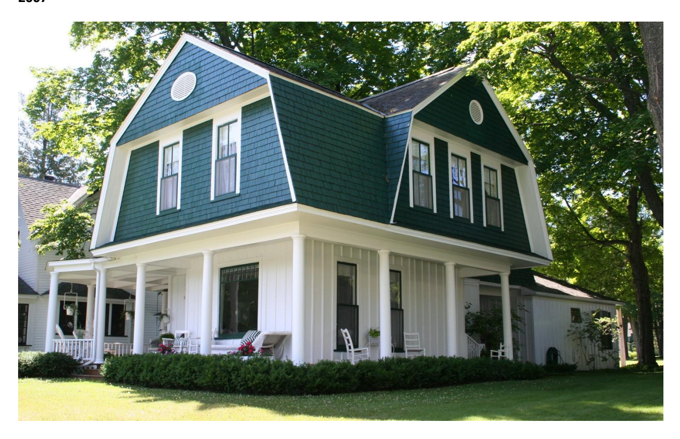
2019 - North and east