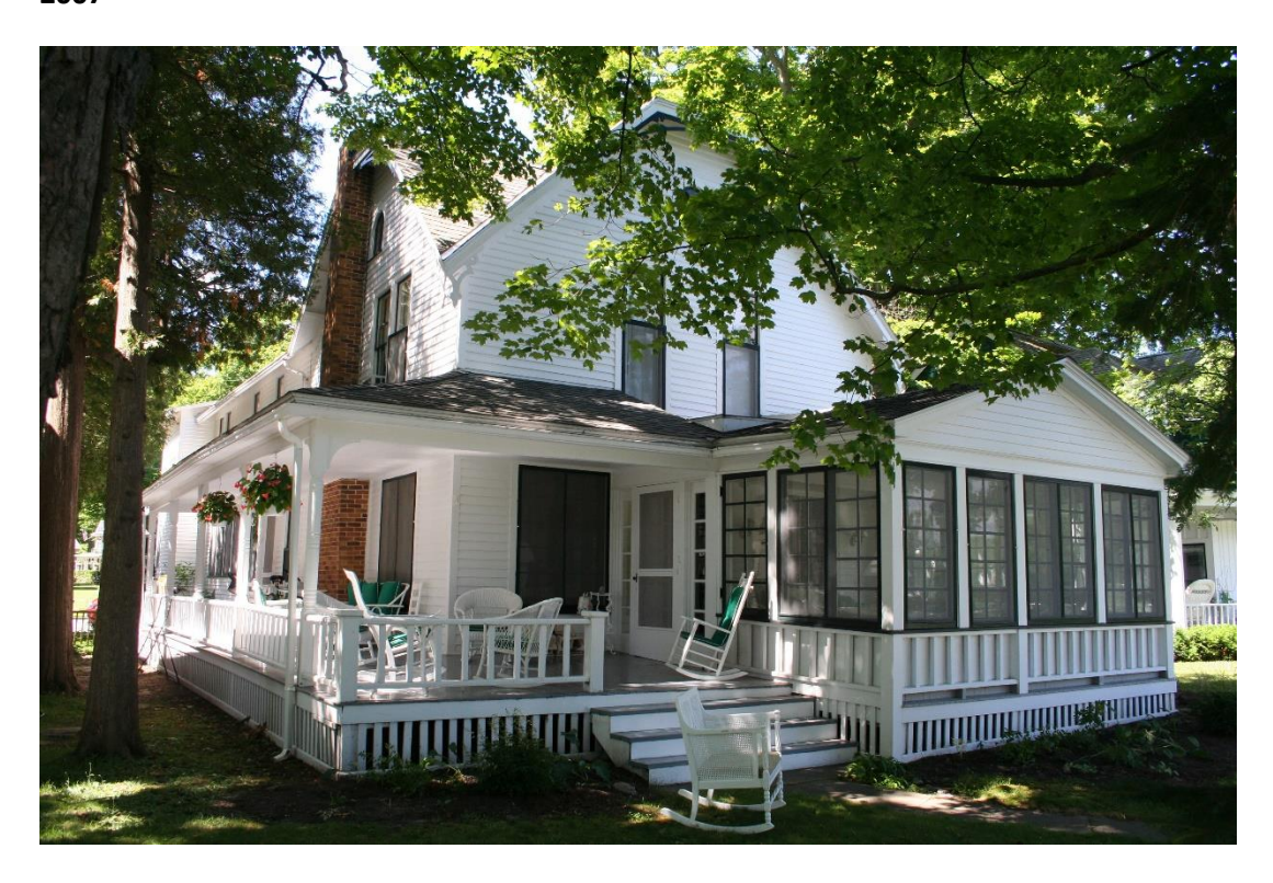
2019 - North and west