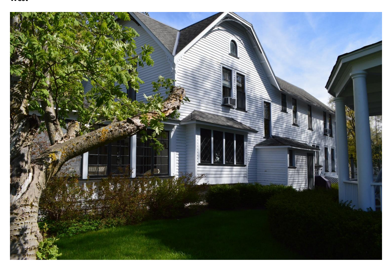
South and west