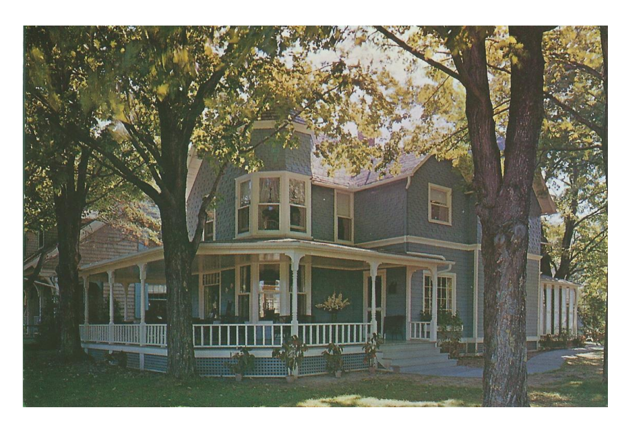
2019 - North