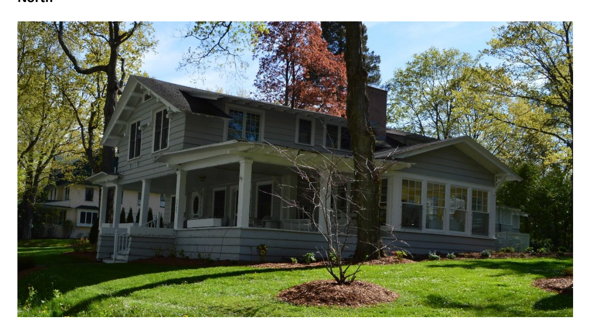
South and west