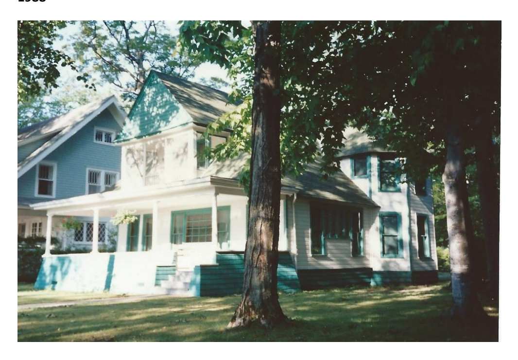
2019 - West and north