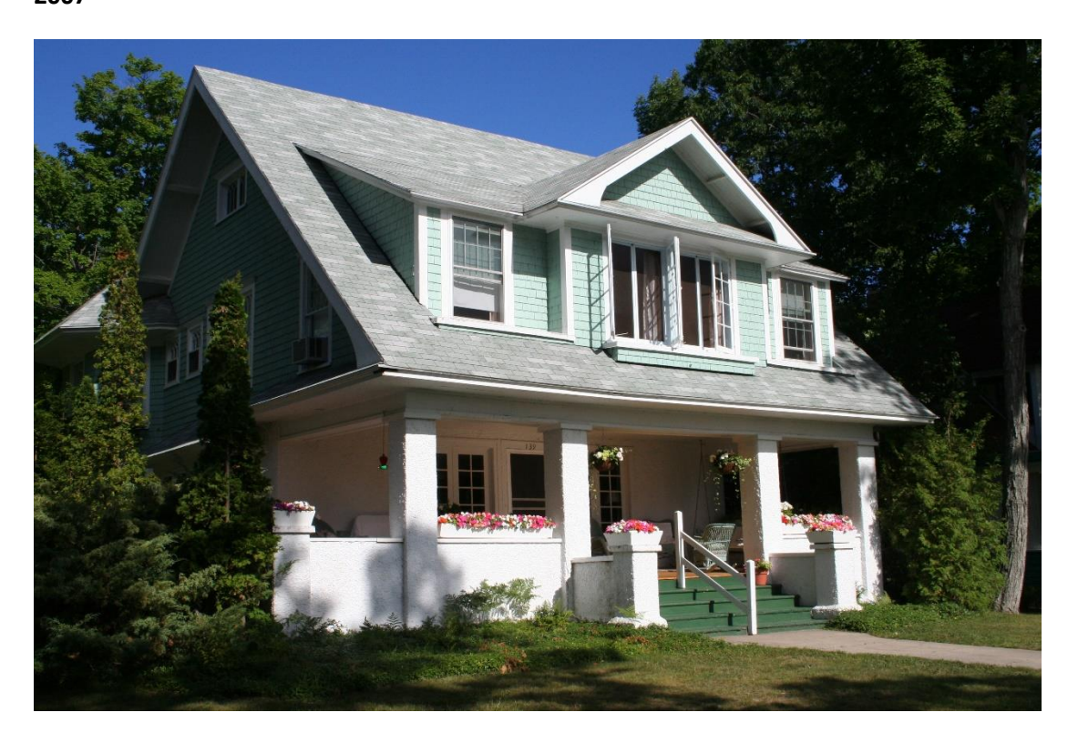
2019 - East and north