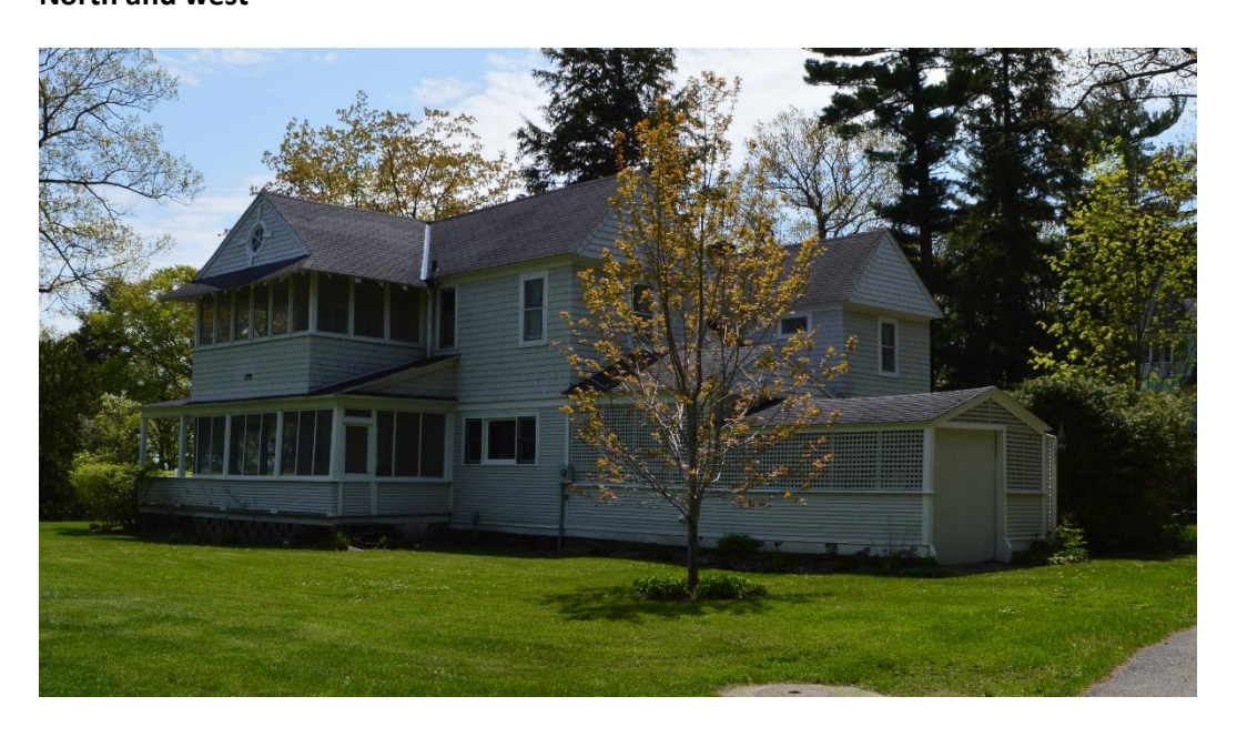
South and west