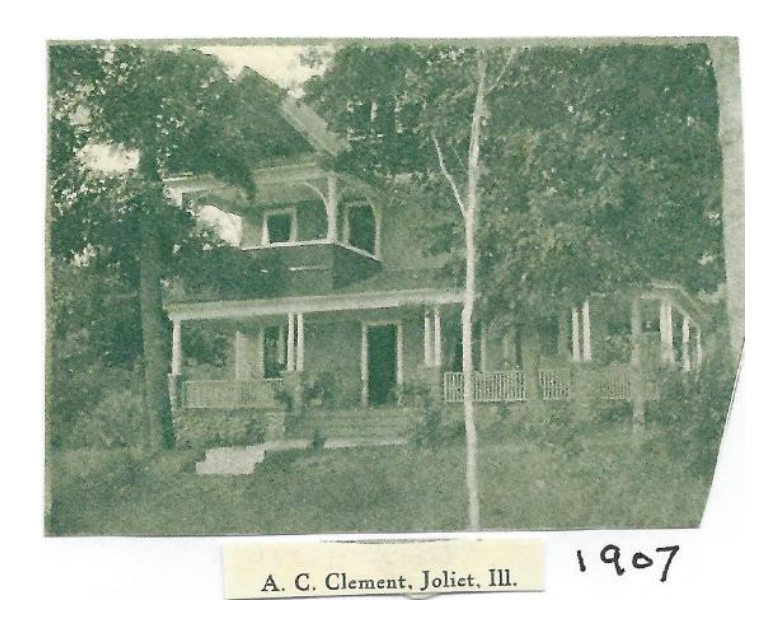
2019 – East