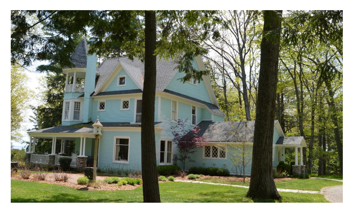
West and south