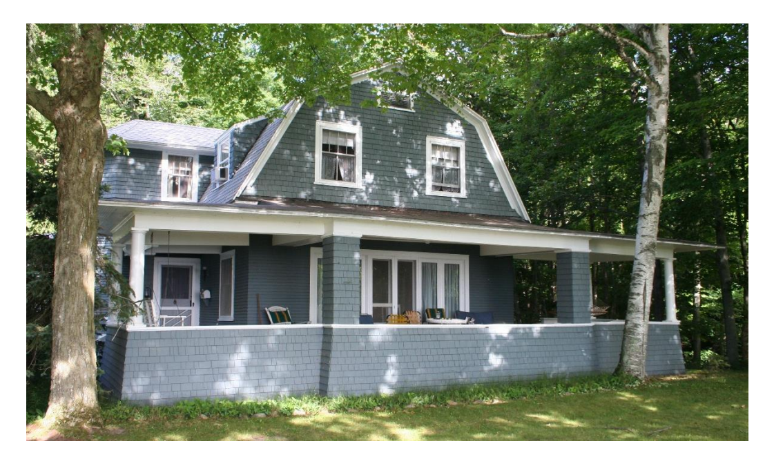
2019 – East and north