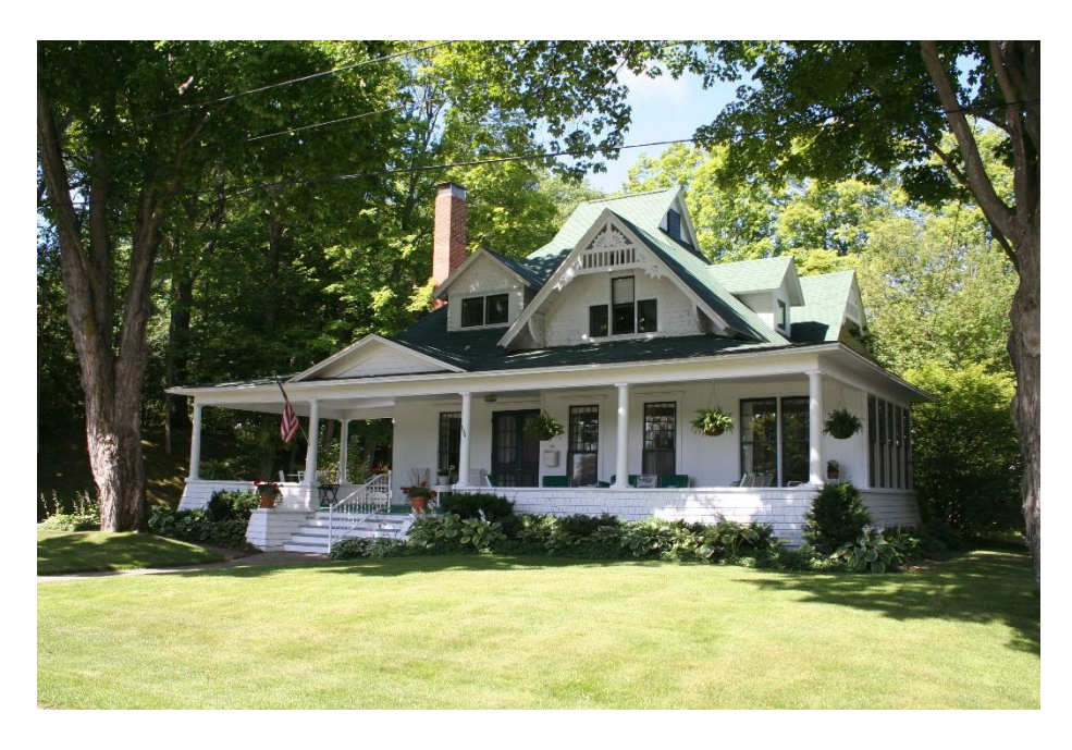
2019 - South and east