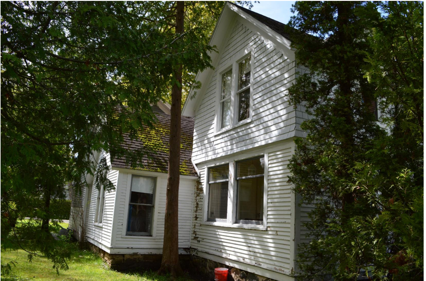
North and west