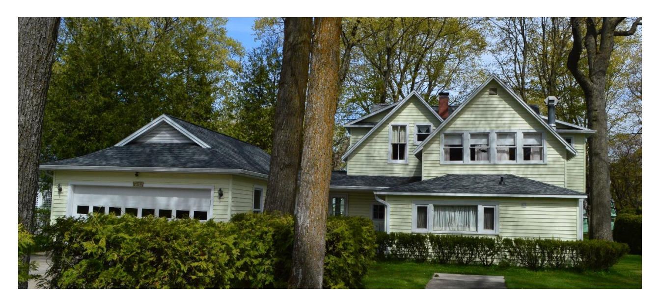
West and south