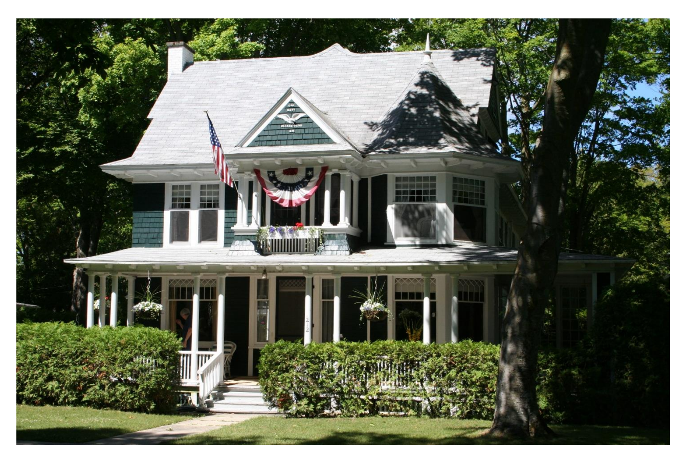
2019 - South