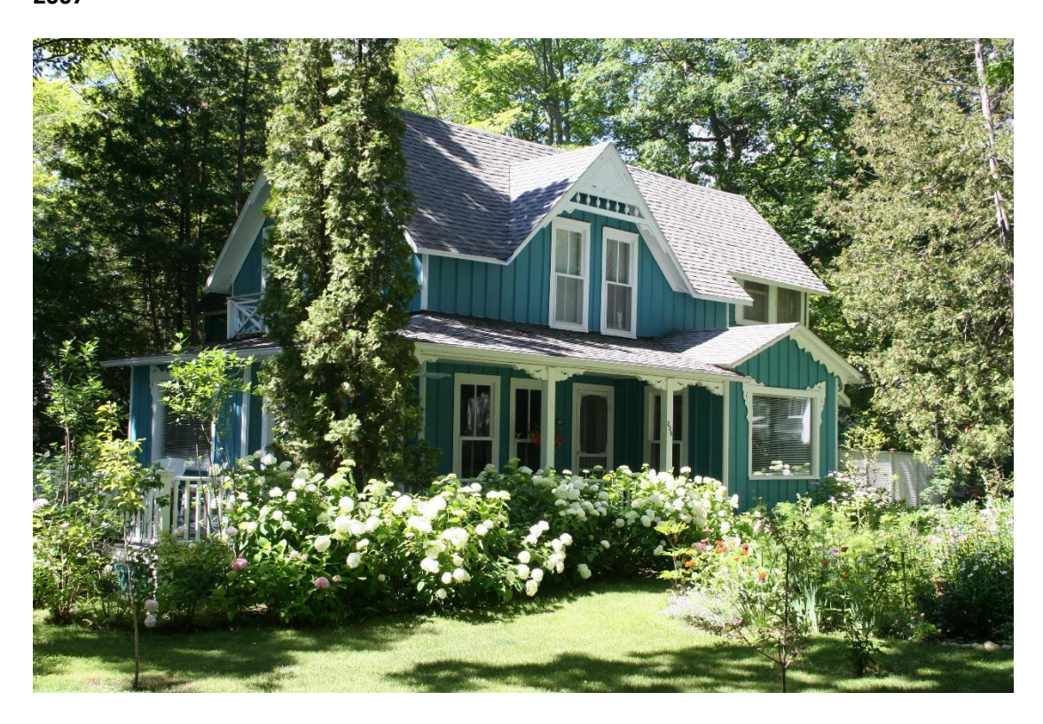
2019 - North