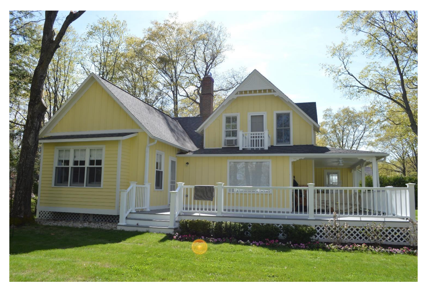
West and north