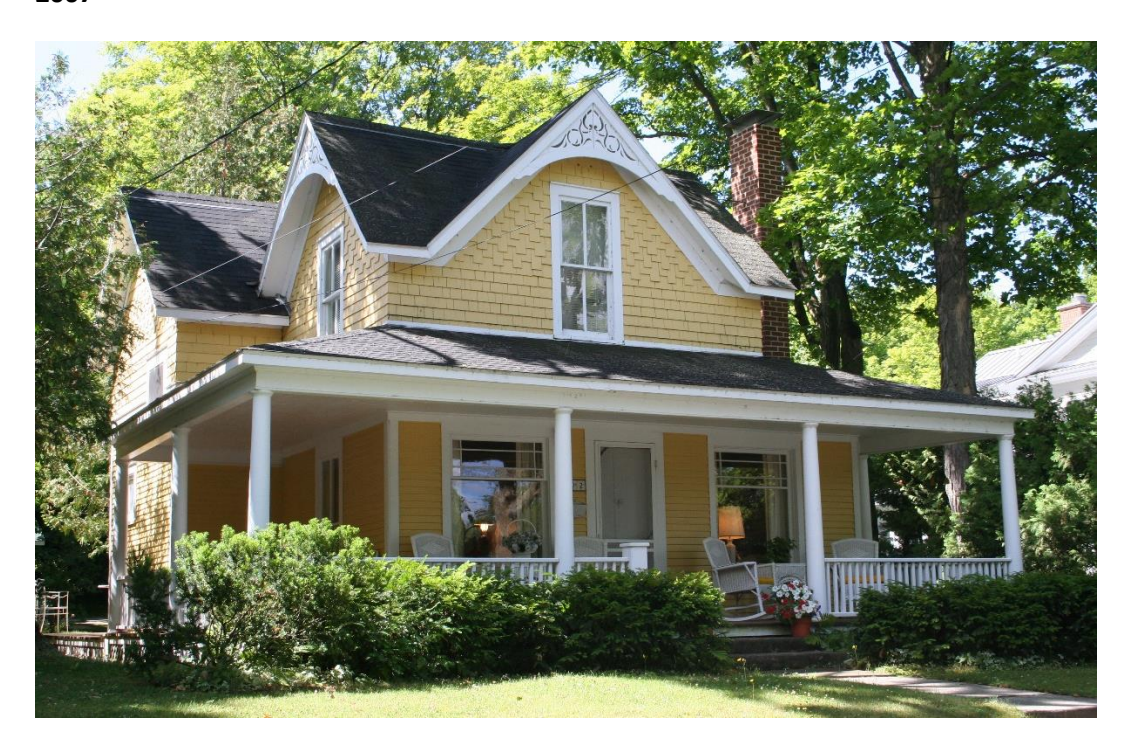
2019 - North