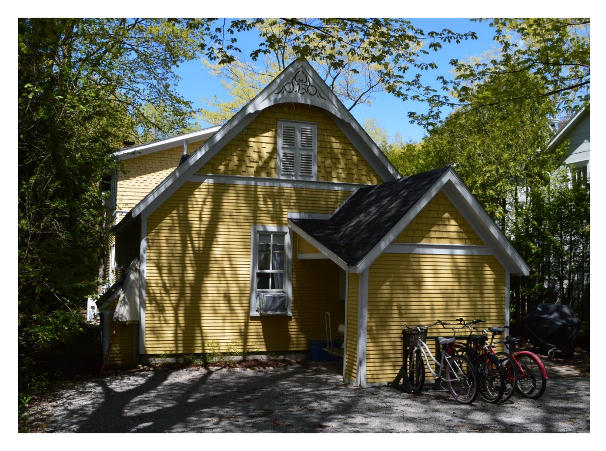
South and east