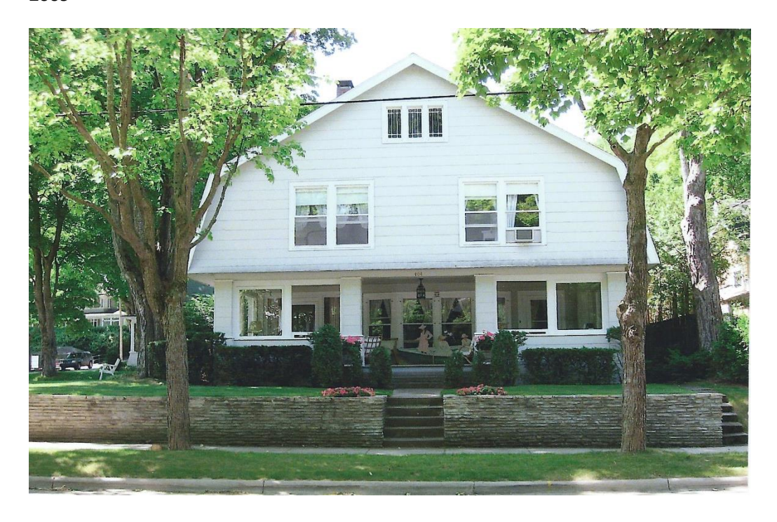
2019 – East and north