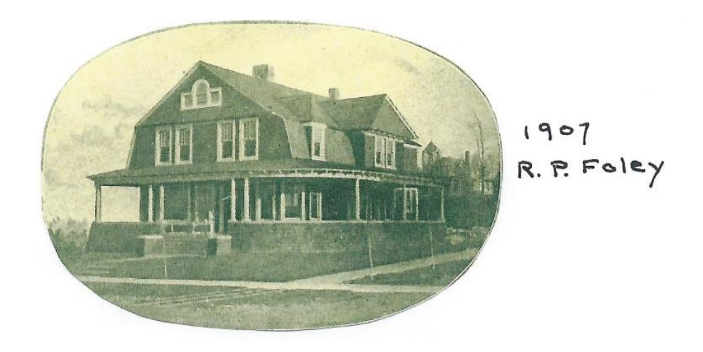
2019 – West